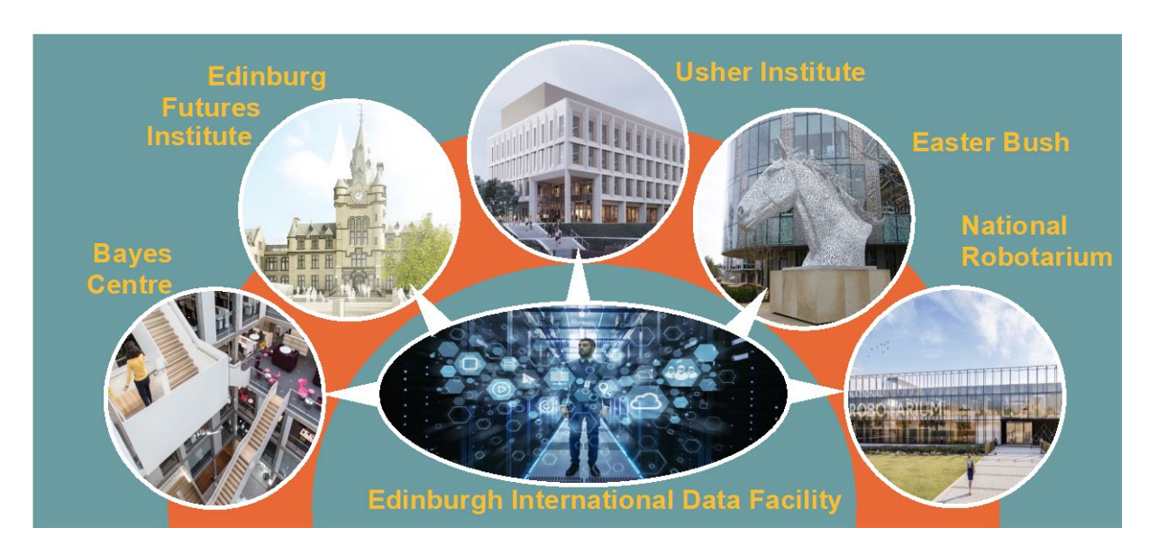
The six DDI Hubs form an externally facing innovation platform supporting ten industry sectors.

8. The City Region Deal financial & delivery plans for the Data-Driven Innovation programme were approved by Court ahead of the academic year 2017/18, underpinning the City Region Deal, signed in August 2018. Delivery of the DDI initiative started immediately after the City Region Deal had been signed.