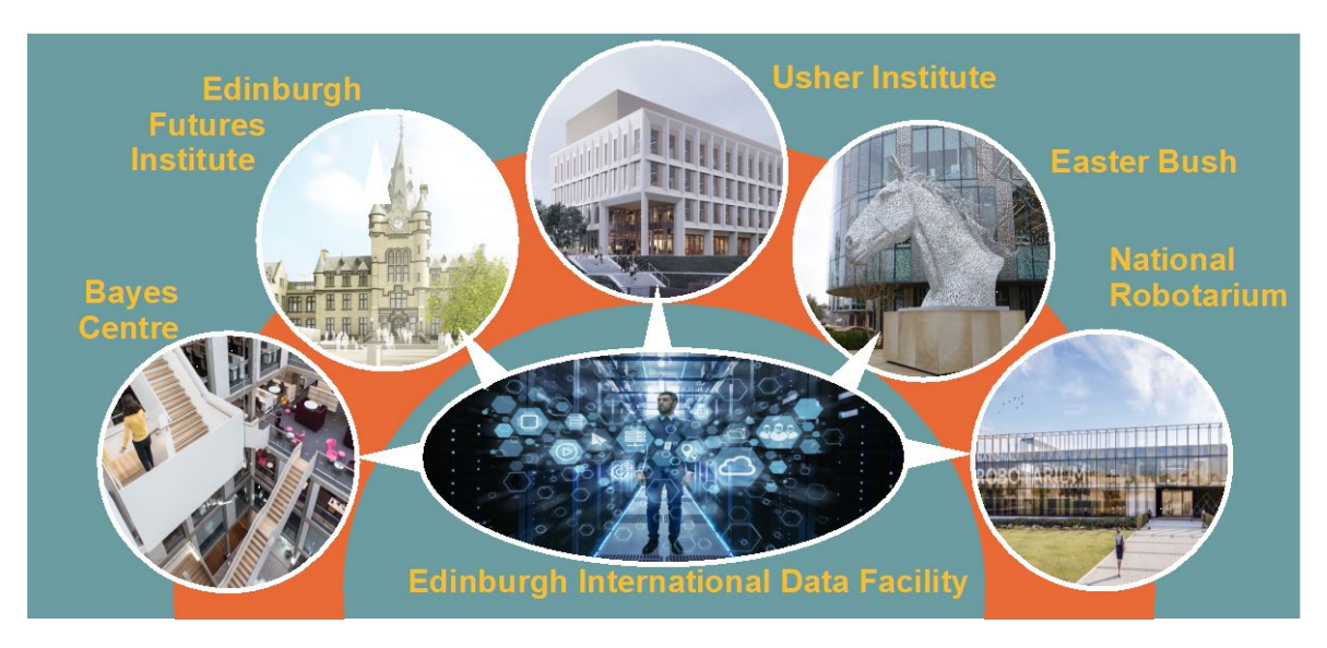
Figure 1: The six DDI Hubs form an externally facing innovation platform supporting ten industry sectors.

Sections 8-35: final version of the report available at: <a href="https://www.ddiannualreport23.com/">https://www.ddiannualreport23.com/</a>